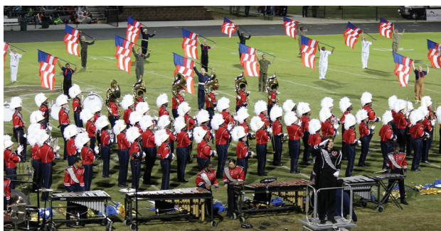
HHS Marching Band with Flag and Dance Team perform award-winning halftime show