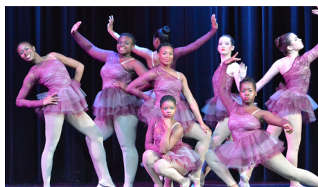
HHS Ballet Performance