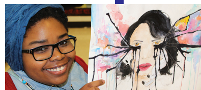
Visual artists' studio work