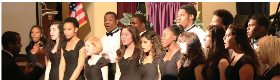
HHS Chamber Singers at a community performance